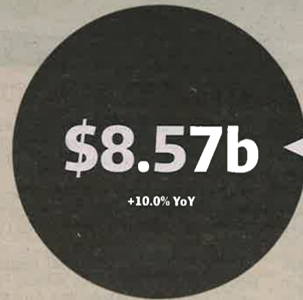
BIG FOUR FIRMS