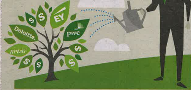
Top 100 accounting firms FY19 revenue breakdown by firm type